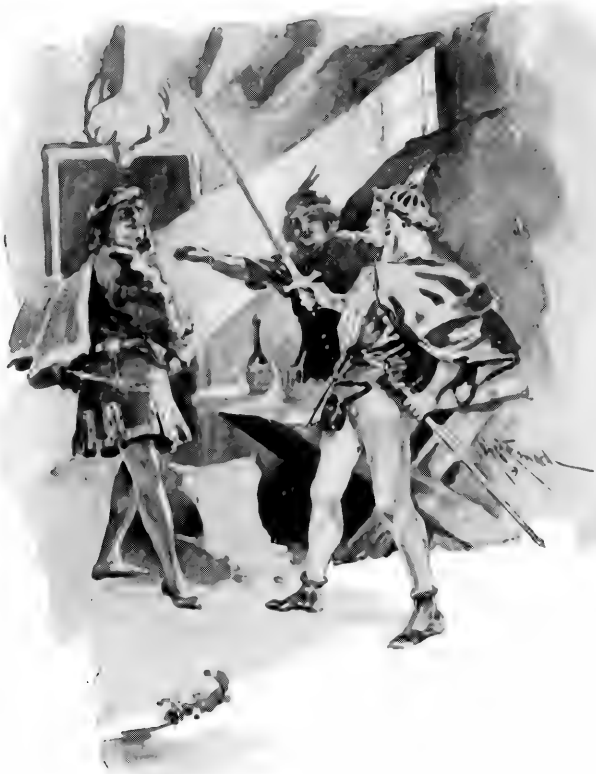
"AND QUICK TO DRAW THE SWORD IN PRIVATE FEUD."—Page 164.